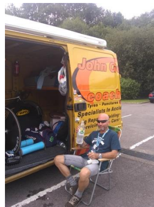
John Gemmell Coachworks